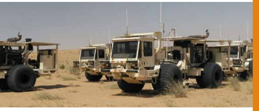
Vibrator trucks from BGP Crew 8636B on the R3 East survey area.

Initial indications confirm the existence of multiple fault blocks, which have similar configurations to the basin's currently producing fields and some of the largest discoveries made in the basin to date.