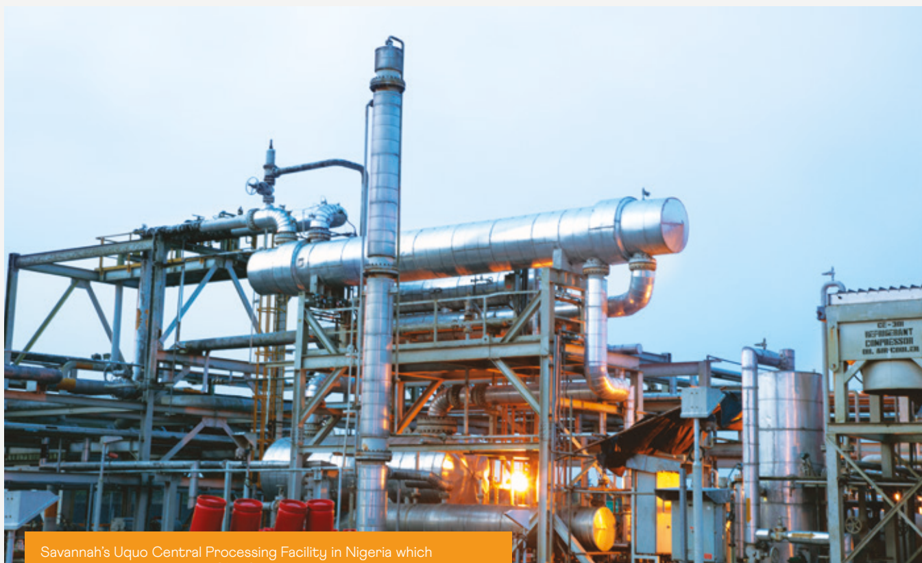
Savannah's Uquo Central Processing Facility in Nigeria which delivers gas enabling over 10% of thermal power generation in Nigeria

Developing our renewable resources speaks to the importance of diversity — as we are seeing right now, a lack of producer diversity and overreliance on a single source (or even a single resource) is a risky venture with sweeping implications. In this world, there's a place for fossil fuels and renewables in a sustainable and balanced energy mix and, like a chameleon, Africa is changing to adapt to both.